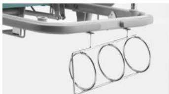
BZ1520 -STEEL BOTTLE HOLDER