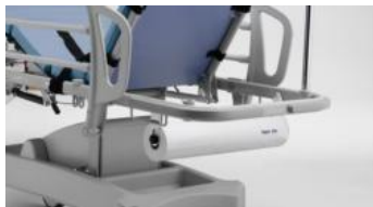
BZ1525 -PAPER HOLDER FOR STRETCHERS