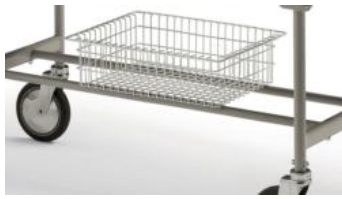
BZ1606 -HOLDER BASKET MADE OF VARNISHED STEEL