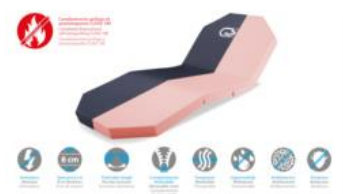
BZ1501 -ANTISTATIC MATTRESS FOR STRETCHERS WITH SIDE RAILS BZ1604