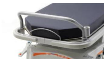
BZ1535 -PUSHING HANDLE