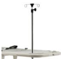
BZ1524 -I.V. STAND, 2 HOOKS, ADJUSTABLE HEIGHT